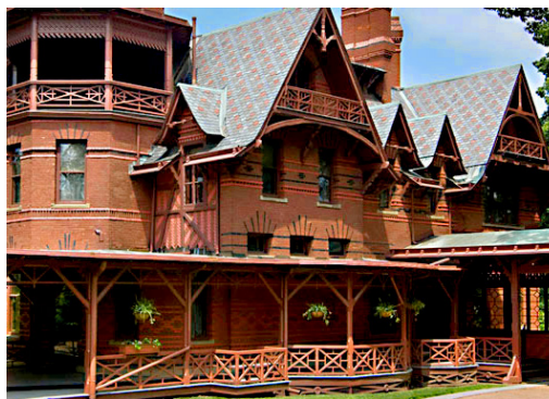
The Mark Twain House