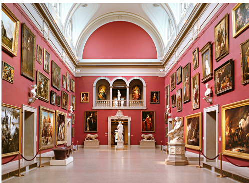
Wadsworth Atheneum Museum of Art